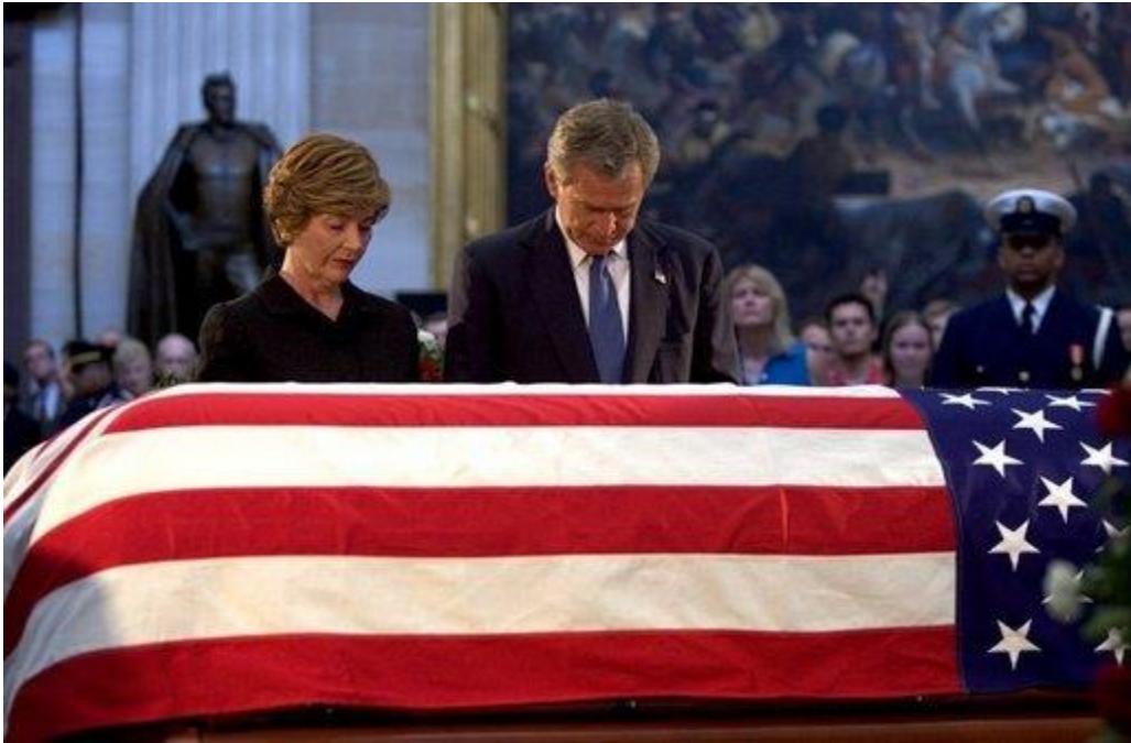
Laura and George W. Bush at the National Memorial in Washington.