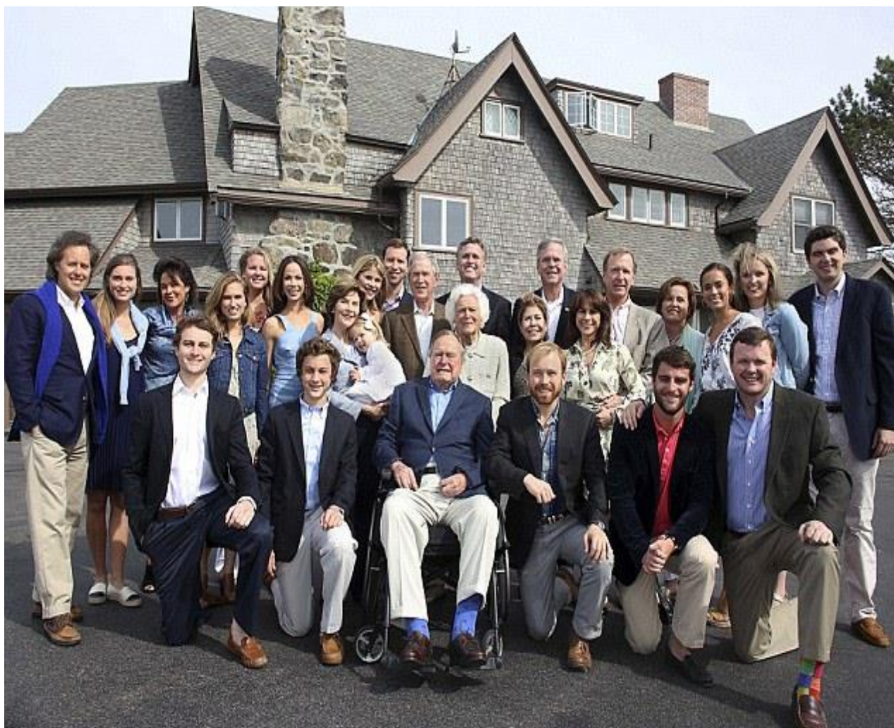
President George H. W. Bush's 92 nd Birthday celebration with his wife and family.