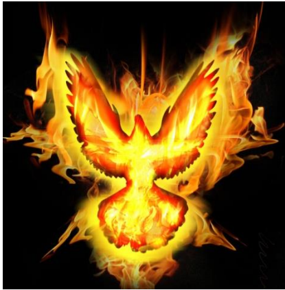
The Holy Spirit